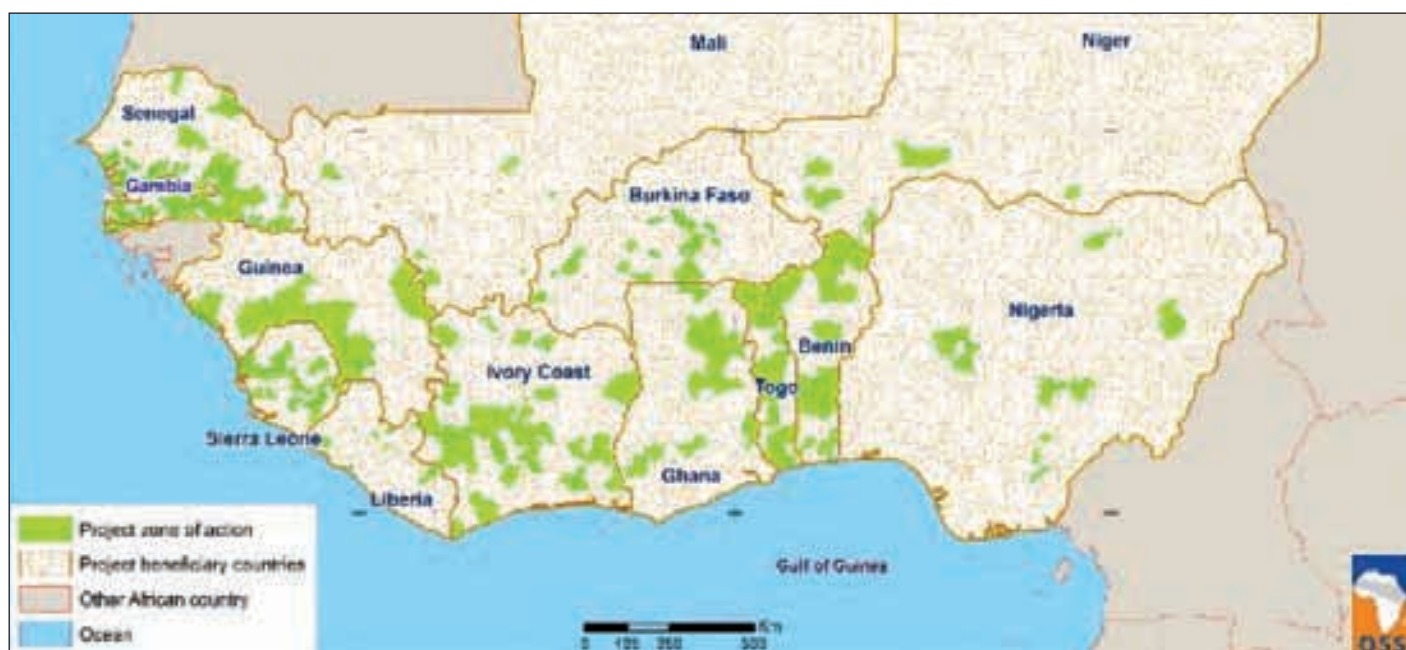
Figure 1: RICOWAS project intervention zones of the 13 participating countries.

The RICOWAS project was designed to build on the achievements of the SRI-WAAPP project. RICOWAS will be the largest SRI scaling-up project to date, implemented over four years from 2023-2027 in the same 13 West African countries as SRI-WAAPP. Funded by the Adaptation Fund (AF), the Sahara and Sahel Observatory (OSS) will oversee overall project implementation. CNS-RIZ/IER in Mali will provide regional technical coordination in partnership with the Climate-Resilient Farming Systems program at Cornell University. At the country level, national research and extension institutions will be in charge of project execution in collaboration with NGOs and farmer organizations, and with technical and scientific partners from the public, private, and civil society sectors (Sahara and Sahel Observatory, 2021). The objective of RICOWAS is to improve climate resilience and increase rice system productivity of smallholder rice farmers across West Africa using a climate-resilient rice production approach. The project aims to reach at least 153,000 rice growers and indirectly benefit 1.5 million people. Figure 1 shows the RICOWAS project intervention zones in the 13 countries.