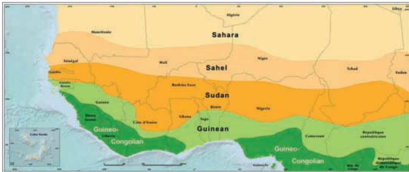
Figure 3: Bioclimatic regions of West Africa (CILSS, 2016)

project zones (Figure 1) clearly depicts how smaller project zones at the border of one country can fuse into larger zones when combined with the border zones of their neighboring countries.