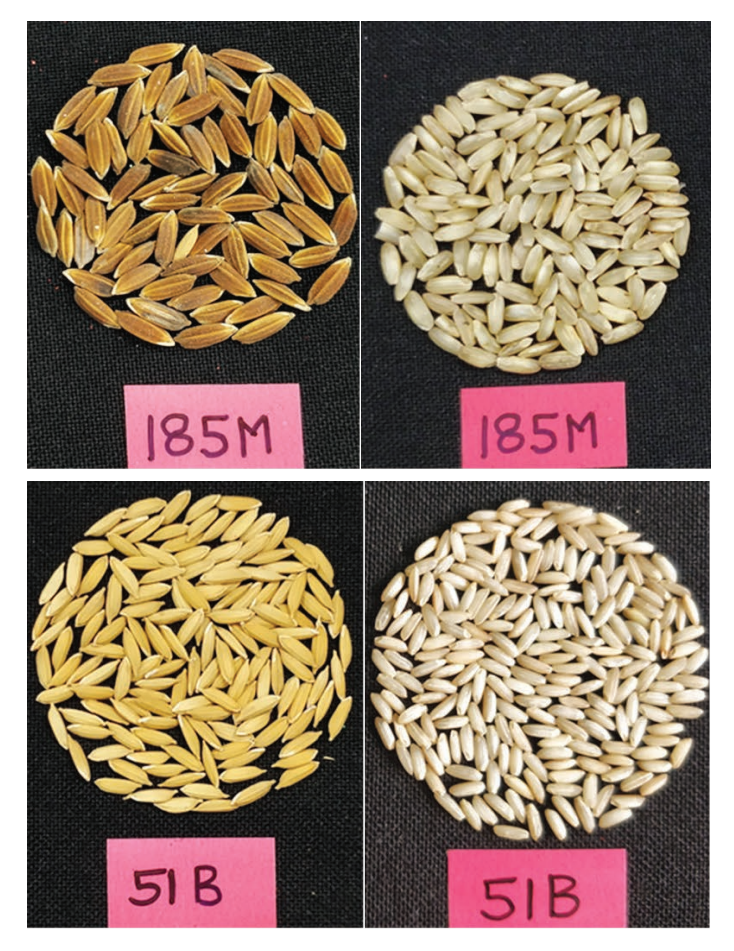
Figure 2: Paddy and brown rice of elite lines 185M [IET 23814] and 51B [IET24475] tested in AICRIP Bio fortification trials

samples such as drying, cleaning, grinding, weighing, digestion and dilution compared to EDXRF method. Previous reports also suggest that the micronutrient concentration values obtained from AAS analysis were higher compared to EDXRF analysis (Singh et. al., 2017). ILs 185M (IET23814), 51B (IET24775), 24K (IET22624), 233K (IET25459), 515Z (IET27998), 61-1B (IET28715), 83B (IET28695), 88B (28706) were entered in AICRIP Bio fortification trials and their respective overall mean Fe and Zn values were 3.3, 31.69 ppm; 4.0, 19.9 ppm; 2.29, 18.7 ppm; 1.6, 18.13 ppm; 3.7, 18.7 ppm; 4.0, 20.19 ppm; 3.2, 19.6 ppm in polished samples across different locations of India (Figure 2). IL185M showed the highest overall mean value of 31.69 ppm zinc in polished samples out of 45 entries across 17 locations in AICRIP 2014. Bioavailability studies using the in vitro Caco-2