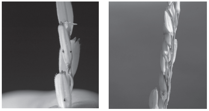
Figure 1: Stigma exsertion types (dual, single and no SE types)

For assessing stigma exsertion type, whole panicle method as described by Akhilesh et al. , 2015 was followed. All the individual spikelets in each panicle were separated and observed using magnifier lens to categorize them into dual, single or no stigma exsertion types (Fig. 1).