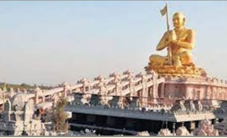
Panchaloha which stands 216-feet-tall, reflects the acres, it is the largest integrated film city in the world mammoth struggle for change which the social and as such has been certified by the Guinness reformer had championed a 1,000 years ago. World Records as the largest studio complex in the Located in a temple town inside the ChinnaJeevar Swamy's ashram near Muchintal, the statue was dedicated to the world by Prime Minister Narendra Modi on February 5, 2022