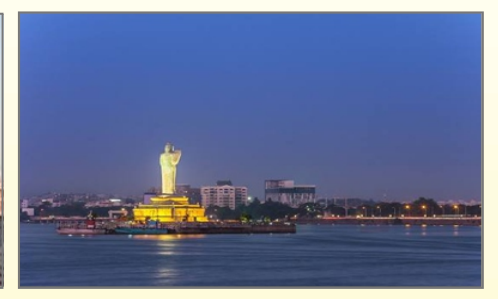
Once upon a time, Hyderabad was known as City of Lakes. Some of these lakes are natural and various are manmade bodies. As per various sources only a few decades back, Hyderabad had a large number of water bodies such as lakes, reservoirs, rivers, streams, aquaculture ponds, tanks etc.